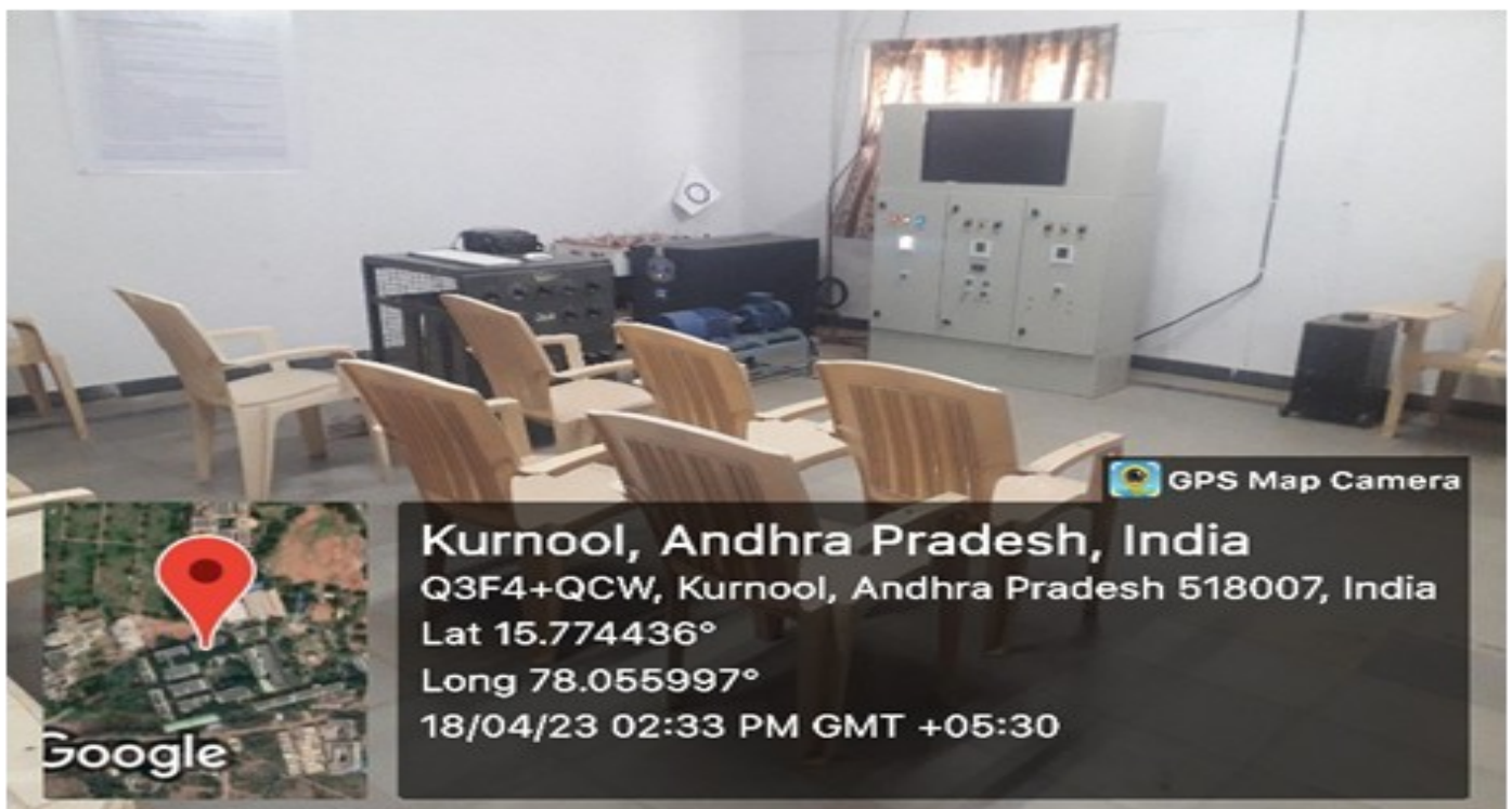
Hybrid Power Systems Lab