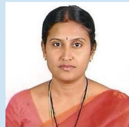
Professor & Head