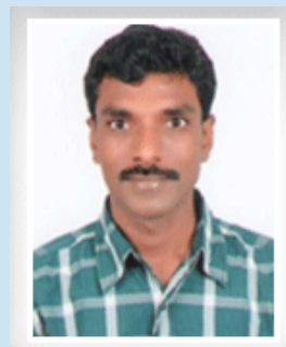
Professor & Head

Empowering the students towards Ebullient Engineers for the benefit